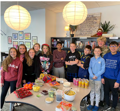
Heart Healthy Snack Buffet