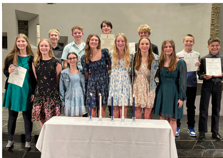
National Junior Honor Society Induction