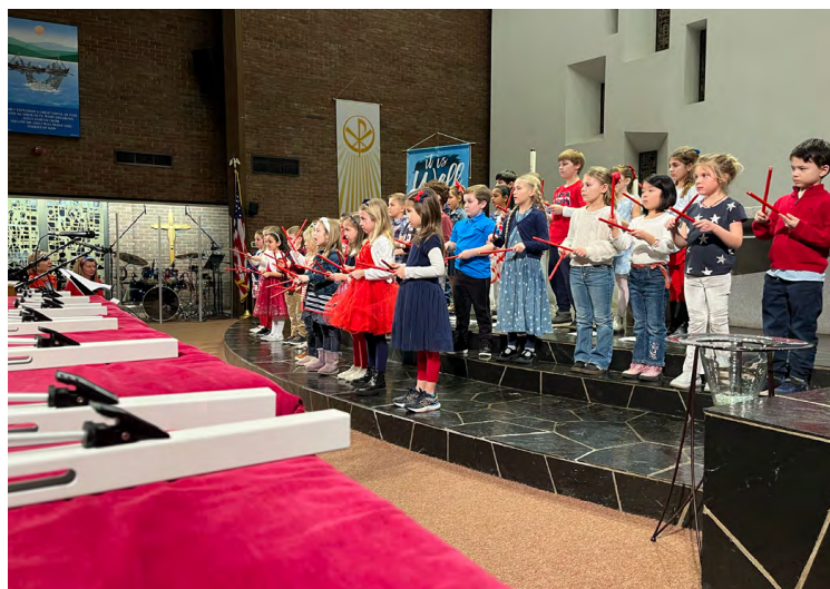
Grade K-2 Music Showcase