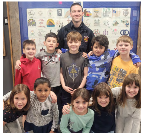
Fire Safety Talks