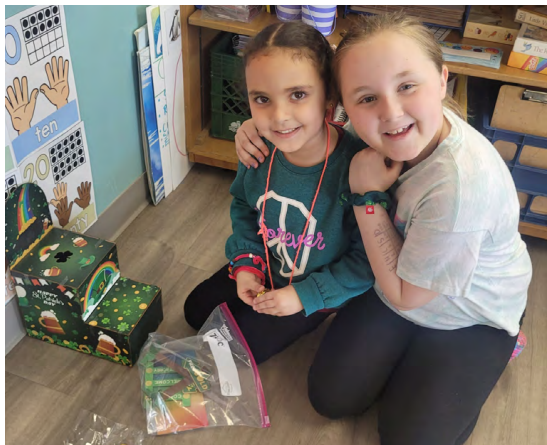
Leprechaun Traps with Reading Buddies